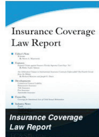
Insurance Coverage Law Report