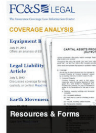
Resources & Forms